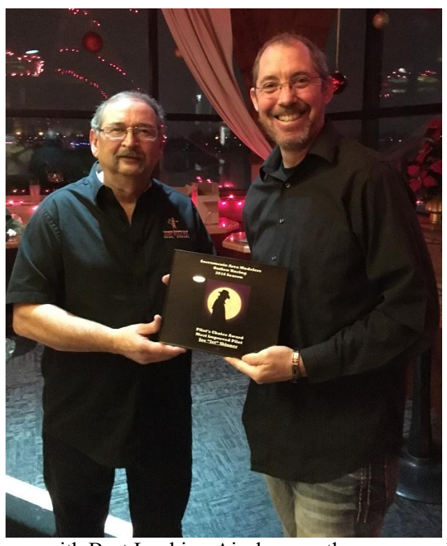
"Joe Jet" also walked away with Best Looking Airplane on the year – and yes "Hollywood" was jealous