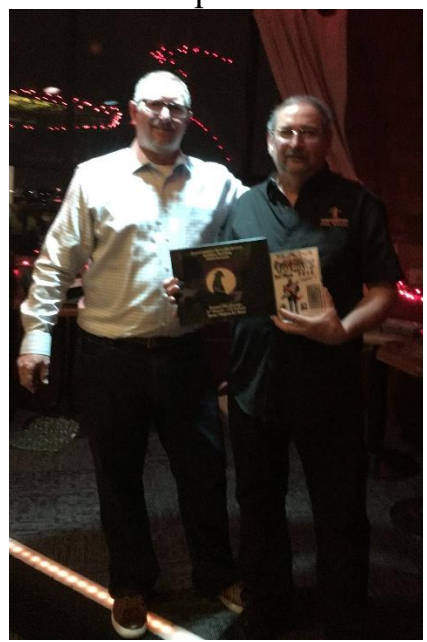
"Super K" is one of 4 pilots on record of winning the OUTLAW title